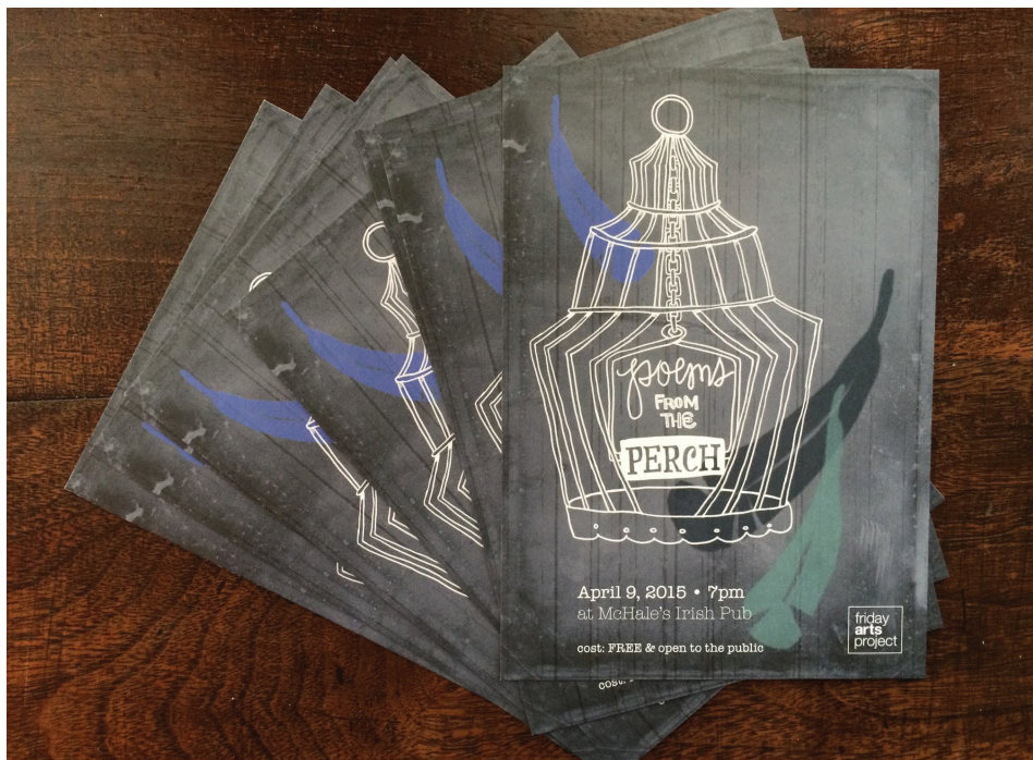
Postcard for the poetry reading event: Poems from the Perch