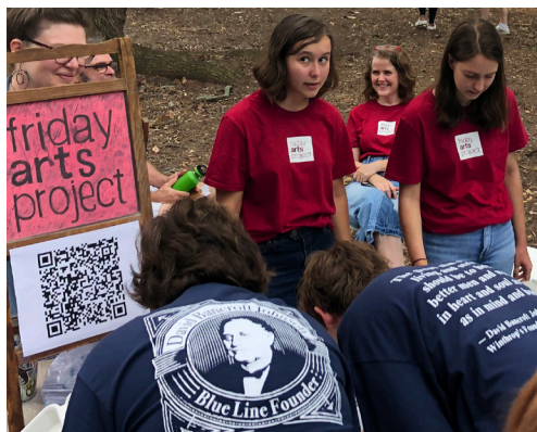
The Emilys at Convocation

As we have mentioned in previous communications, we use a good portion of the year to prepare for their arrival—making sketchbooks. The sketchbook is a great physical example of what we value as we connect with people about deeper things over the arts. It is something physical, allowing us to give students something tangible. And it is also an object usable for scribbling words or images of ideas, thoughts, feelings, pictures, etc. as the students think about the world they live in. Jesus Himself became physical, someone that could be heard, touched, and seen; and He also stirred ideas, thoughts, feelings—even images of deeper things—inviting everyone He encountered to consider the Truth about this world and who He is.