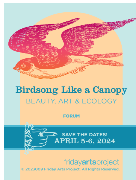
Small postcards about the forum next month

If you would like to partner with us in ministry, visit our giving page on Cru’s website: www.cru.org/0402593